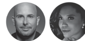
Yannick Nézet-Séguin, conductor Angel Blue, soprano

At the height of the 20th century's Great Depression, African-American composer Florence Price transcribed the daily struggles men and women faced through the evocative power of the orchestra. A veritable sound smith, Montréal-based Keiko Devaux works with acoustic and electroacoustic sound to create original compositions. Angel Blue, one of the most in-demand sopranos in the world, lends her stunning voice to Barber's work.