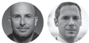
Yannick Nézet-Séguin, conductor David Jalbert, piano